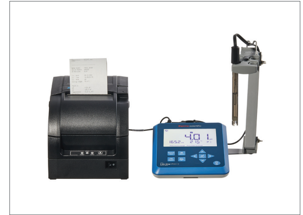
Data logs and calibration logs can be exported via the communication port to a computer or printer.