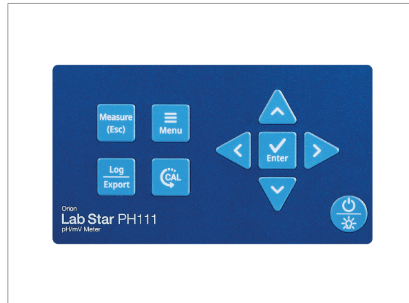
Keypad is designed with buttons for durability in the lab and easy wipe down or disinfection.