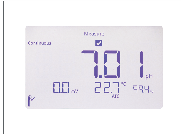
On-screen icons indicate measurement stability statuses, giving you greater confidence in your readings.