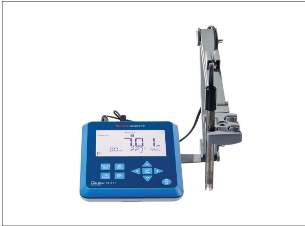
Each meter comes with a stand that helps facilitate electrode movement into and out of samples.