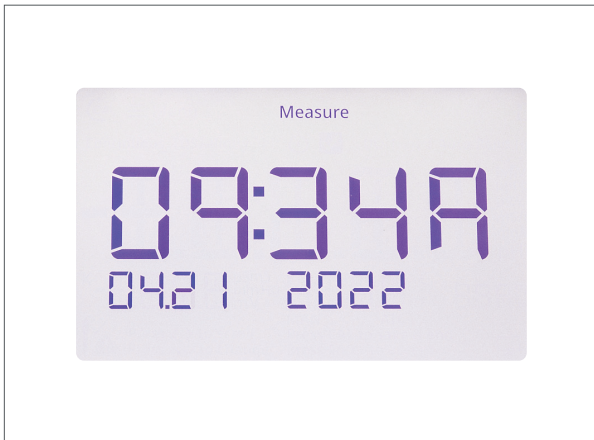
All data logs and calibration logs are date and time stamped for GLP/GMP reporting.